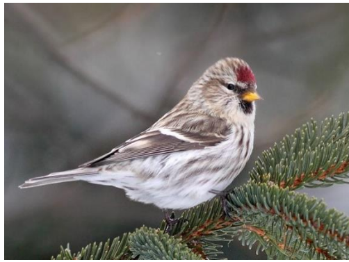
Common Redpoll (Michel Bordeleau)