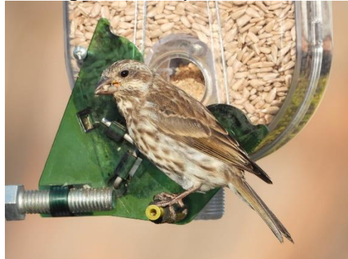
Purple Finch (Denise Bonefon)