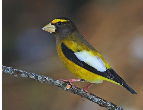
Evening Grosbeak (Michel Bordeleau)

Be vigilant and perhaps you will encounter these northern visitors.