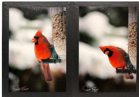
Greeting cards with cardinal at a cardinal feeder by Sophie Thibault