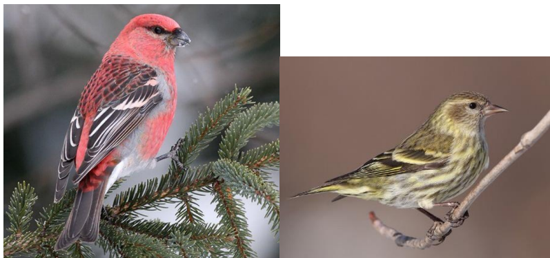
Pine Grosbeak and Pine Siskin (Michel Bordeleau)